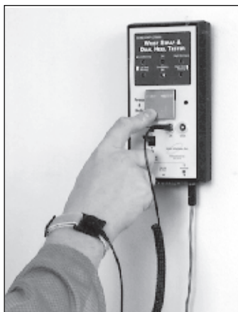
Figure 3 - Wrist Band View

7. The meter can also be attached to work surfaces using two adhesive backed hook and loop strips provided.