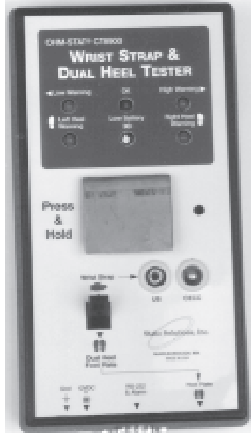
Figure 2. - ZeroStat® MTR-8900

Shown on right is the more advance MTR-8900 Combination Tester with automated tracking software